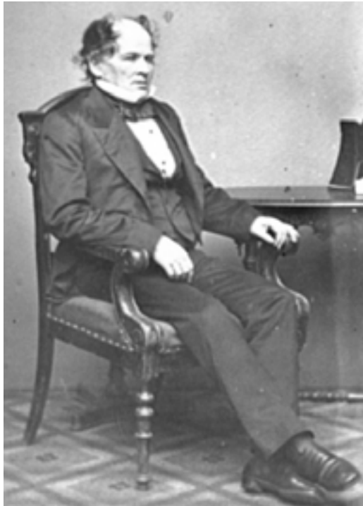
Matthew Maury

Merged COADS and WMO-No. 47 data 1980-1997 should be made available.